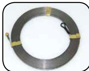
DRAW WIRE- Hook + Ball