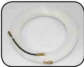
DRAW WIRE- Nylon