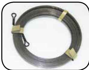
DRAW WIRE- Hook + Hook